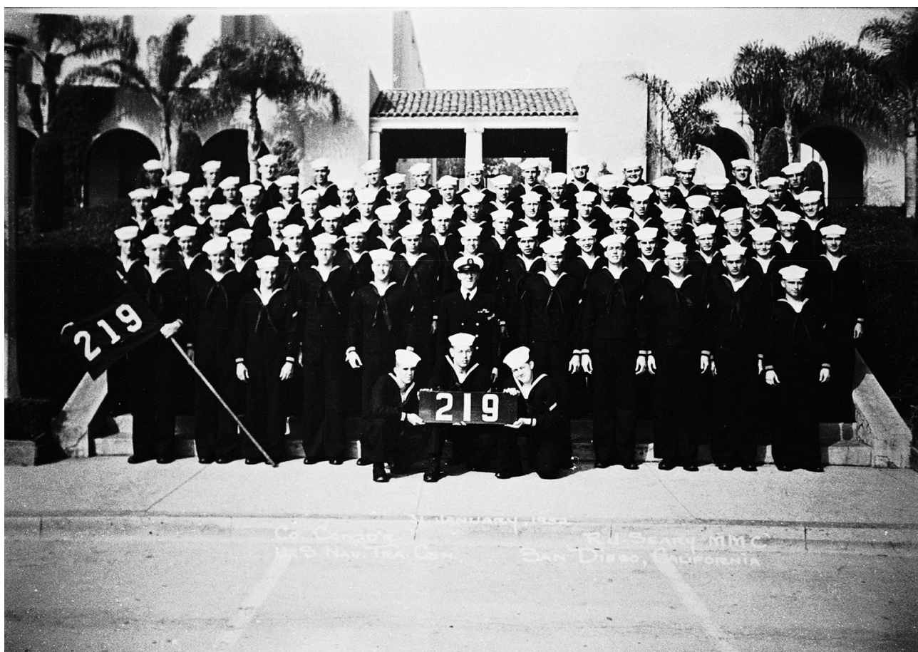
Photograph 2: Dad's Navy Bootcamp Picture