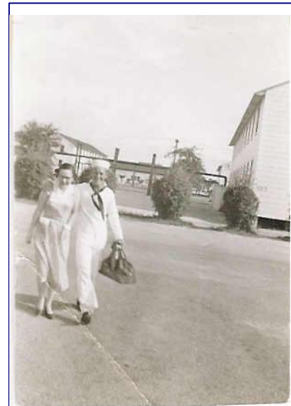
Photograph 3: Mom and Dad on the Kingsville Naval Air Station